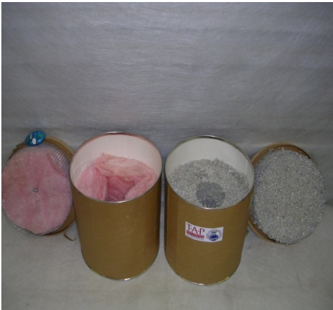
T•A•P Sound Box (R) eliminates piercing alarm, while fiber glass (L) permits sound through.

See and hear this demonstration of T•A•P's ability to muffle a high-decibel personal alarm at PestWorld and other T•A•P promotions.